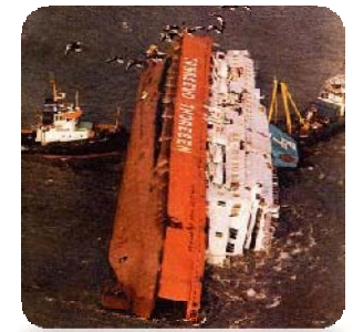
Herald Of Free Enterprise 1987