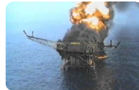
Piper Alpha 1988