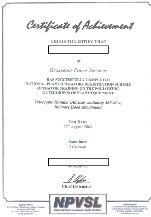
Examples of NPORS card (rear view) and Training Certificate