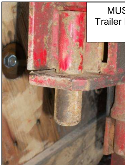
MUS Plant Cable Trailer bar retaining lug

It was also found that the GAP trailer retaining bar had a shorter “retaining lug” than that on the Morrison plant cable trailer.