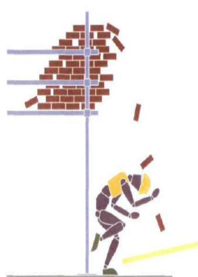
And Stop These Accidents/Incidents – Leading to Injury or damage