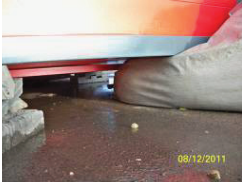
Photo shows: View at south-east corner: Site cabin landed on “bean bag safety cushion” and provided approximately 400mm void between the base of the site cabin and the ground level. We understand that the injured party was under the site cabin at this location.