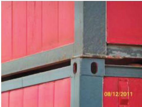
Photo shows: View of remaining cabins immediately after incident – cabins are not physically connected or secured to the ground.

Photo shows: View at south-east corner: Site cabin landed on “bean bag safety cushion” and provided approximately 400mm void between the base of the site cabin and the ground level. We understand that the injured party was under the site cabin at this location.